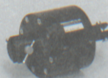
Compact with Mounts