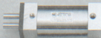
Twin Rod Non-Rotating